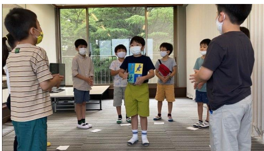
Figure 2: The children are more attentive towards others if they do a special clap before an activity