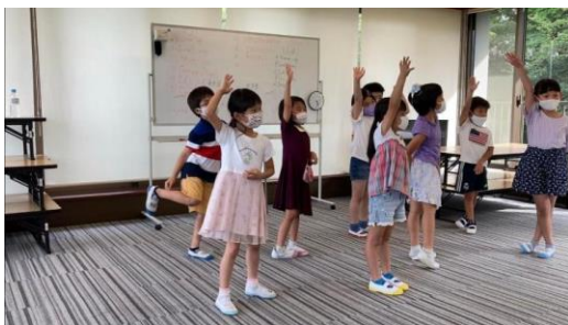
Figure 1: Raising a hand, a simple and effective way to avoid lesson disruption