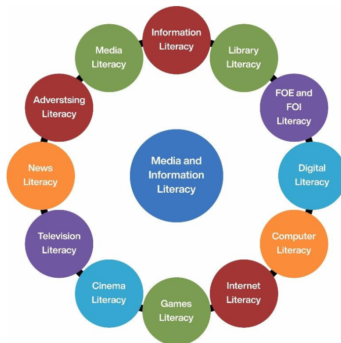
Figure 2. Media Literacy and related concepts

The training and awareness-raising activities organized for each of the aforementioned concepts have made it possible to ensure the correct use and consumption of all kinds of media. Internet-based interactive platforms that allow user interaction continue to develop and change day by day. As stated by Cohen and Mihailidis (2013; 4), as the internet continues to evolve technologically, organizational tools for user experience evolve as well, and today users have accounts on numerous platforms where they organize information. All information and content produced, shared, disseminated and accessed in all of these accounts is devoid of control. Therefore, it is extremely prone to disinformation, fake news and misdirection. In order to better understand the importance of being literate regarding the above-mentioned concepts, the relationship between these concepts is visualized in the figure below (UNESCO, 2021):