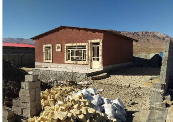
Figure 3. Contemporary housing of abqad village, chenaran, Iran

and demand for extensive monitoring and supporting approach to the direct intervention, because the villagers are involved in the manufacturing process, has a higher chance of success.