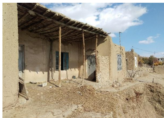
Figure 1. Original housing of Abqad Village, Chenaran, Iran

Original housing: The origin of the original rural housing is pre-industrial period which is recognized and defined under titles such as period of tradition or architecture without architects. Original housing architecture is the result of many years of manufacturing experience and its residents