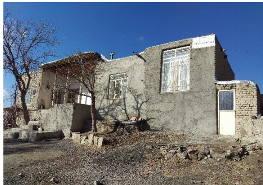
Figure 2. Transitional housing in Abqad village, Chenaran, Iran

Transitional housing: Transitional housing is a form of traditional housing that have been habitable due to changes made by residents in the contemporary period. The historical origins of transitional housing returns to contemporary period after the land reform. The importance of such housing is that it is considered as a ring between original and contemporary housing and shows how the modern needs of rural residents can be emerged in the body of the original architecture. Transitional housing generally consists of the original house with contemporary additions, so often two ways of building original and contemporary housing along with elements and details of every period are visible in a single housing. Residents of such housing are often middle-aged and elderly people of the village and the main reason for the formation of this type of housing is the villagers' hope to achieve higher levels of comfort, which is not found in original housing. Also the rural housing compared to original housing is lower than the compatibility of architecture.