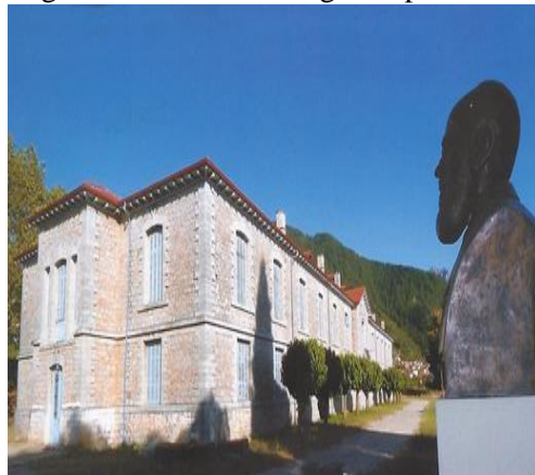
Figure 4. Historical significant museum and school