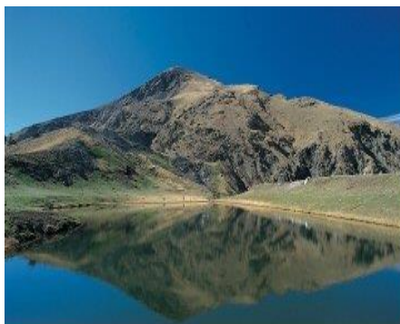
Dragolimni of Smolikas (2200m)