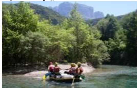
Figure 5. Athletic tourism for suitable management

Having positive emotions, most of the participants talked about the reduction of time distance from big urban centers because of Egnatia and Ionia road. To questions about weaknesses and worries for the place, everyone pointed out, and mostly the elderly: “In many settlements we stayed a few and aged enough.”