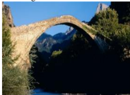
The bridge of Konitsa