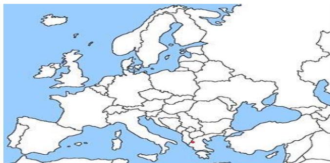
Figure 1. Geographical space of region Konitsa

The variety of its natural and cultural sources in combination with the ultimate memory and consciousness of local people makes it one of the most attractive regions in Greece. Taking into account the importance of these sources for the peripheral economy, the need of their vital utilization is a semantic concern, so as to benefit local people, visitors, peripheral and cultural economy.