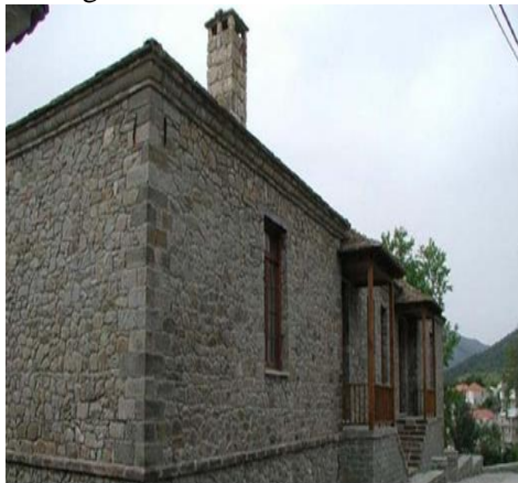
Enthografic Museum of Craftsman of Stone