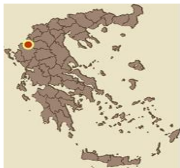
Konitsa in Hellenic Space