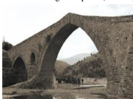
Figure 2: Historical stone's bridges of Konitsa