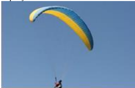
Slope of Parachute