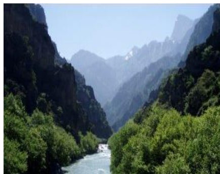
Figure 3.: Natural beauty in mountains of Pindos

Now there is a holistic confrontation of things, as far as the environment, society and people are concerned. In this context, Europe Council has specified the relationship between cultural heritage and sustainable development in the following contracts: “European contract for the Landscape” of 2000 and “Framework of the Contract for the Value of Cultural Heritage for the Society” of 2005. Through sustainable development the meaning of cultural heritage is reduced to a new dimension, where it is connected and interdependent directly to social, financial and environmental sector.