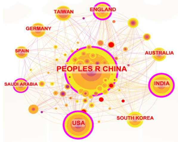
Figure 2: Top countries contributing to research on emerging technology in e-commerce

Table 1 list the top three emerging technology in e-commerce based on the keyword on the total publication within five years. Analyzing the most keyword in the dataset reveals that AR is the main topic of interest in the e-commerce technology trend research area. AR also has investigated many aspects related to e-commerce and the industry, with the top topic from Masood & Egger (2019) being the top-cited article on AR implementation. Thus, research focusing on blockchain technology placed number two, most used in the logistic aspects for supporting e-commerce circulation with the top cited article from Kamble et al. (2019). The trend in AI also being the third top interest.