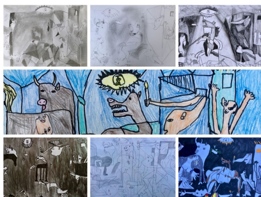
Figure 3. Students' worksheets, on the subject of Pablo Picasso's visual work, Guernica