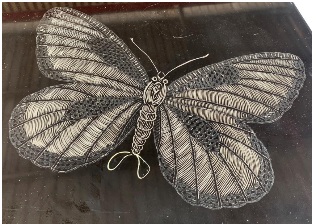
Figure 1: Painting and engraving technique in Binh Duong province.

As a result, in lacquer techniques in Binh Duong province, the rhythm of the engraving technique is a specific voice created by the continual repetition and alternation of engraved lines, similar to a flowing circuit that sometimes forms shapes on the work. Deep or shallow engraving processes, as well as dark or light coloring procedures, produce dark, occasionally light results. These techniques have elevated the painted and etched works in Binh Duong to an unfathomable degree, much like a harmonious symphony. This is a valuable artistic asset that artisans, painters, and art critics must evaluate, share, and utilize Binh Duong engraving skills to create modern lacquer paintings. Nowadays, efforts are being made to elevate the lacquer painting style in Binh Duong to regional standards.