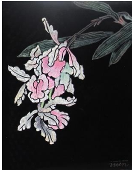
Figure 6: Painting engraved with the theme of orchids Author: Tu Phen. Size: 30 x 40 cm.